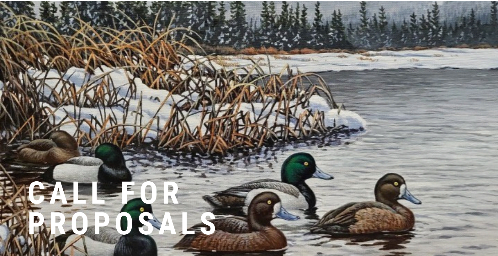
Art Image: 2025 WHC Art Competition winner - "Northward Bound - Greater Scaup" by Ken Ferris