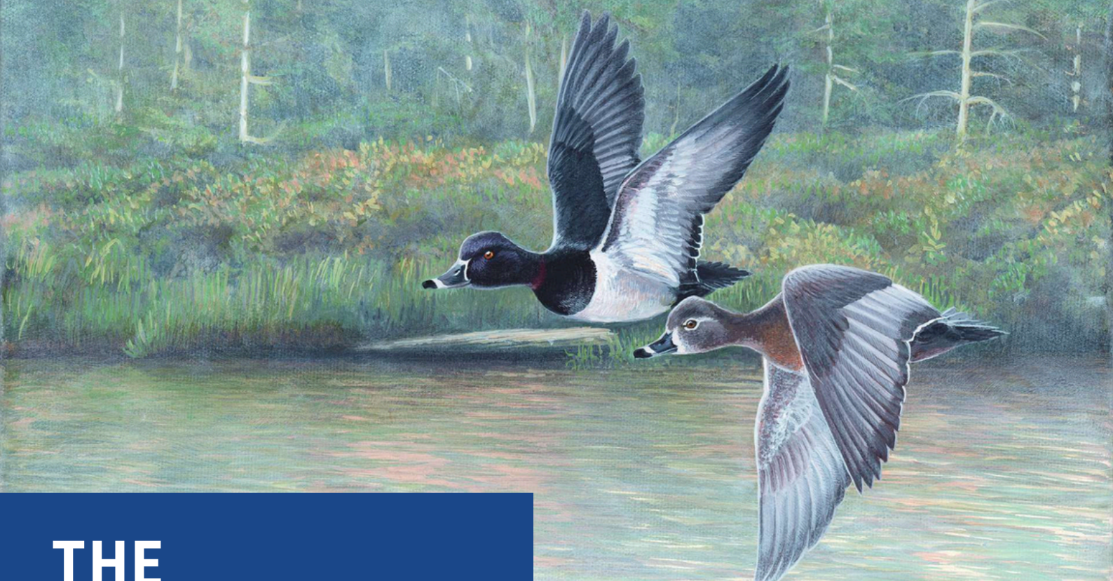
2023 Conservation Stamp "Boreal Mist - Ring-necked Ducks"