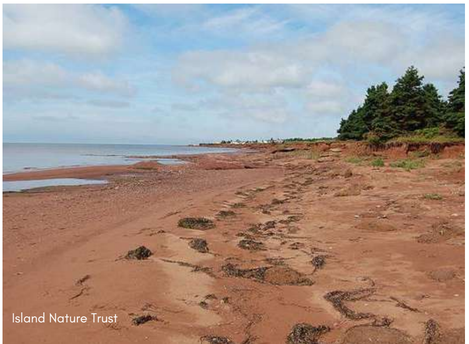
Island Nature Trust