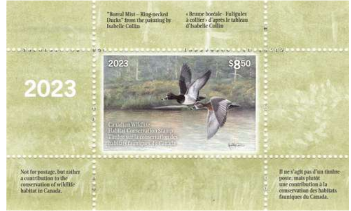
2023 Canadian Wildlife Habitat Conservation Stamp Pane

To many people, whether they're hunters, conservationists, or otherwise, the Canadian Conservation Stamp is much more than just a picture. While it is attached to the Migratory Game Bird Hunting Permit, it is also a symbol of conservation and a relic of memorable hunting seasons passed. We at WHC love to hear what the WHC Stamp means to our supporters. Whether it's a stamp collection, an old permit or a conservation edition print, let us know what the stamp means to you using by using #WHCStamp on social media.