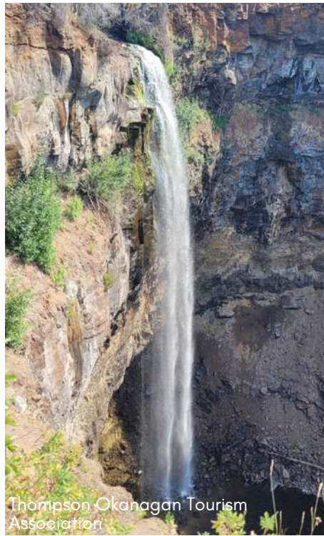
Thompson Okanagan Tourism Association