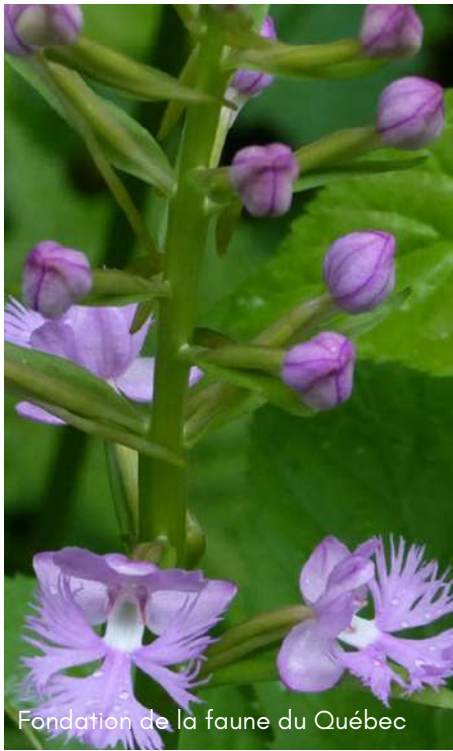
Fondation de la faune du Québec