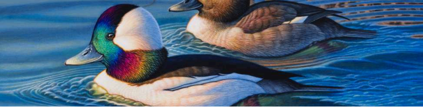
2024 Winning Painting By: DJ Cleland-Hura