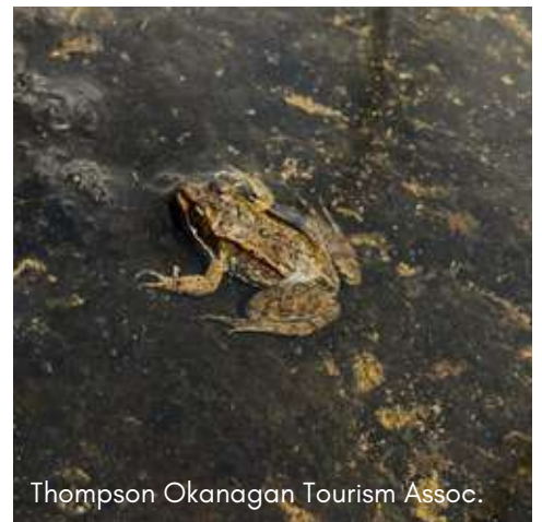
Thompson Okanagan Tourism Assoc.