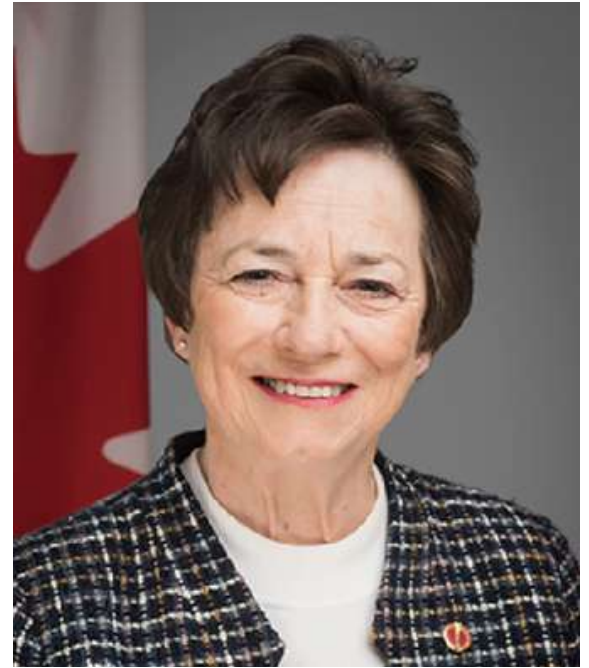
Senator Diane Griffin

Senator Griffin is a lifelong and passionate Canadian conservationist from Prince Edward Island who was named to the Senate of Canada by Prime Minister Justin Trudeau. Griffin is a former provincial deputy minister of environmental resources and a recipient of the Governor General's Conservation Award, the Queen Elizabeth II Diamond Jubilee Medal, and the P.E.I. Environment Award for her incredible dedication and work to protect nature. She also served as executive director of the Island Nature Trust and is a published author, writing the book Atlantic Wildflowers , which showcases 129 species of flowering plants found throughout Atlantic Canada.