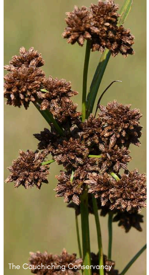
The Couchiching Conservancy