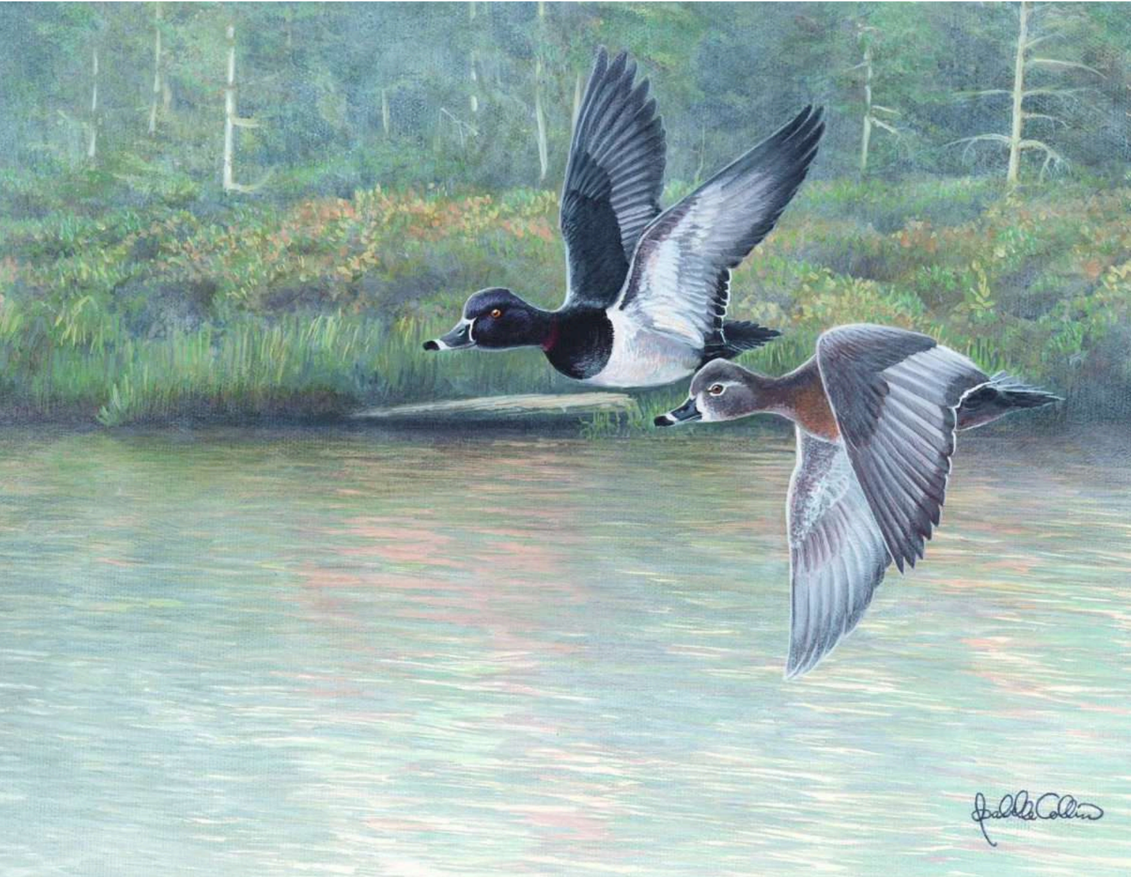
2023 Canadian Wildlife Habitat Conservation Stamp and Print image, "Boreal Mist - Ring-necked Ducks" by Isabelle Collin