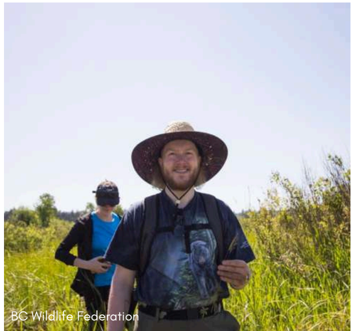
BC Wildlife Federation