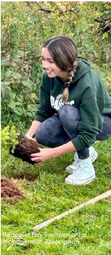
Bedegue Bay Environmental Management Association