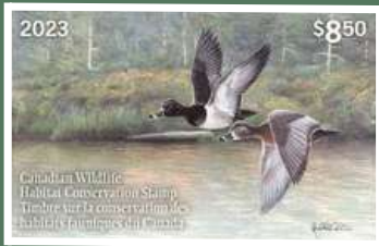
© His Majesty the King in Right of Canada, as represented by the Minister of Environment and Climate Change, 2023