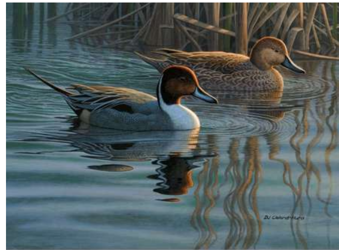
2020 Winning Painting By: DJ Cleland-Hura

To learn more about the Stamp, please visit whc.org/the-stamp