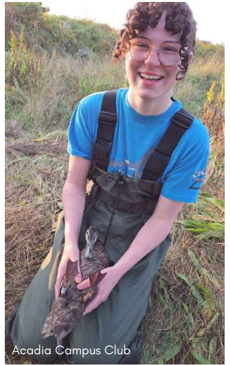
Acadia Campus Club