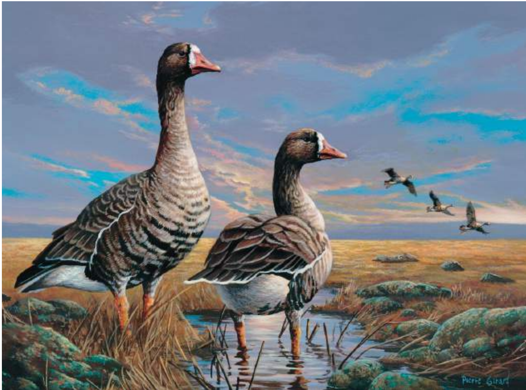
2022 Canadian Wildlife Habitat Conservation Stamp and Print image, "Nordic Light - White Fronted Goose" by Pierre Girard.