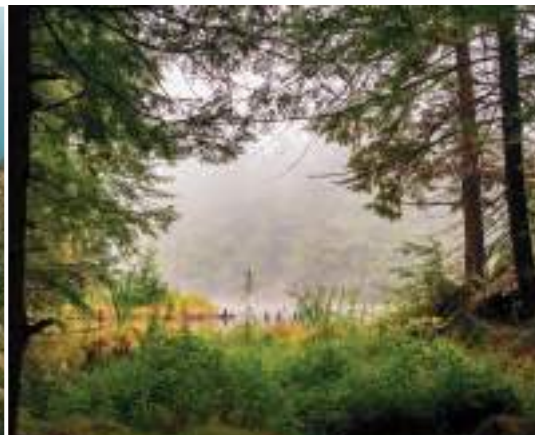
Photo Credit: Forêt Jolicoeur-McMartin_ACRE - photo - Grégoire Crévier