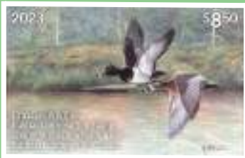
© Her Majesty the Queen in Right of Canada, as represented by the Minister of Environment and Climate Change, 2023