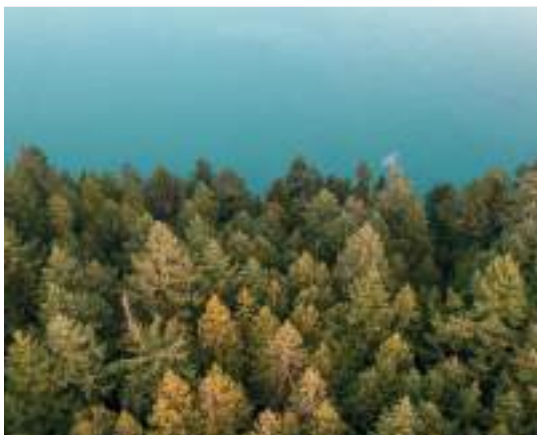
Kingfisher Forest