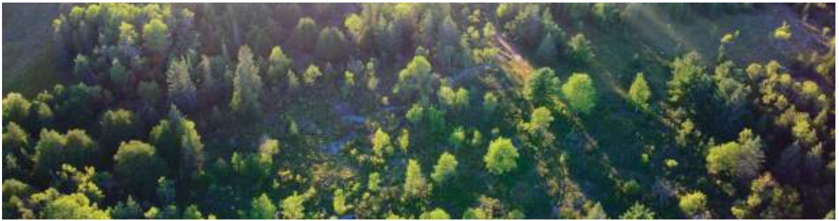
Photo Credit: Deverell-Morton property (credit to Aiesha Aggarwal and Brolin Devine)