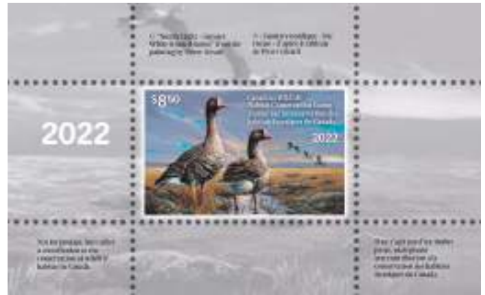
Image: 2022 Canadian Wildlife Habitat Conservation Stamp Panel

To many people, whether they're hunters, conservationists, or otherwise, the Canadian Conservation Stamp is much more than just a picture. While it is attached to the Migratory Game Bird Hunting Permit, it is also a symbol of conservation and a relic of memorable hunting seasons passed. We at WHC love to hear what the #WHCStampMeans to our supporters. Whether it's a stamp collection, an old permit or a conservation edition print, let us know what the stamp means to you using #WHCStampMeans on social media.