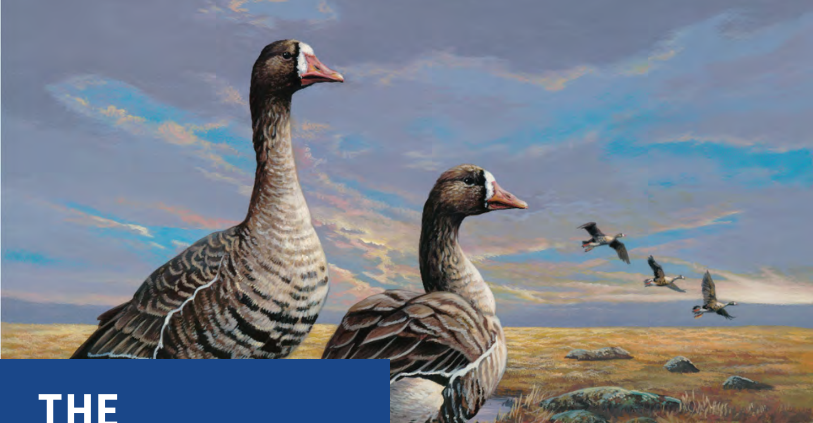
2022 Conservation Stamp "Nordic Light - White-fronted Goose"