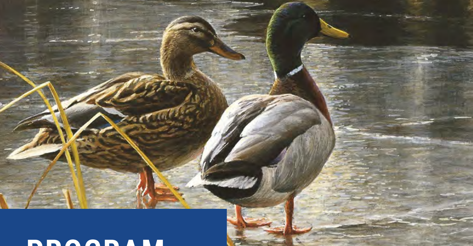
The inaugural painting in 1985 by Robert Bateman "Mallard Pair - Early Winter"