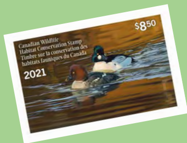
© Her Majesty the Queen in Right of Canada, as represented by the Minister of Environment and Climate Change, 2021.