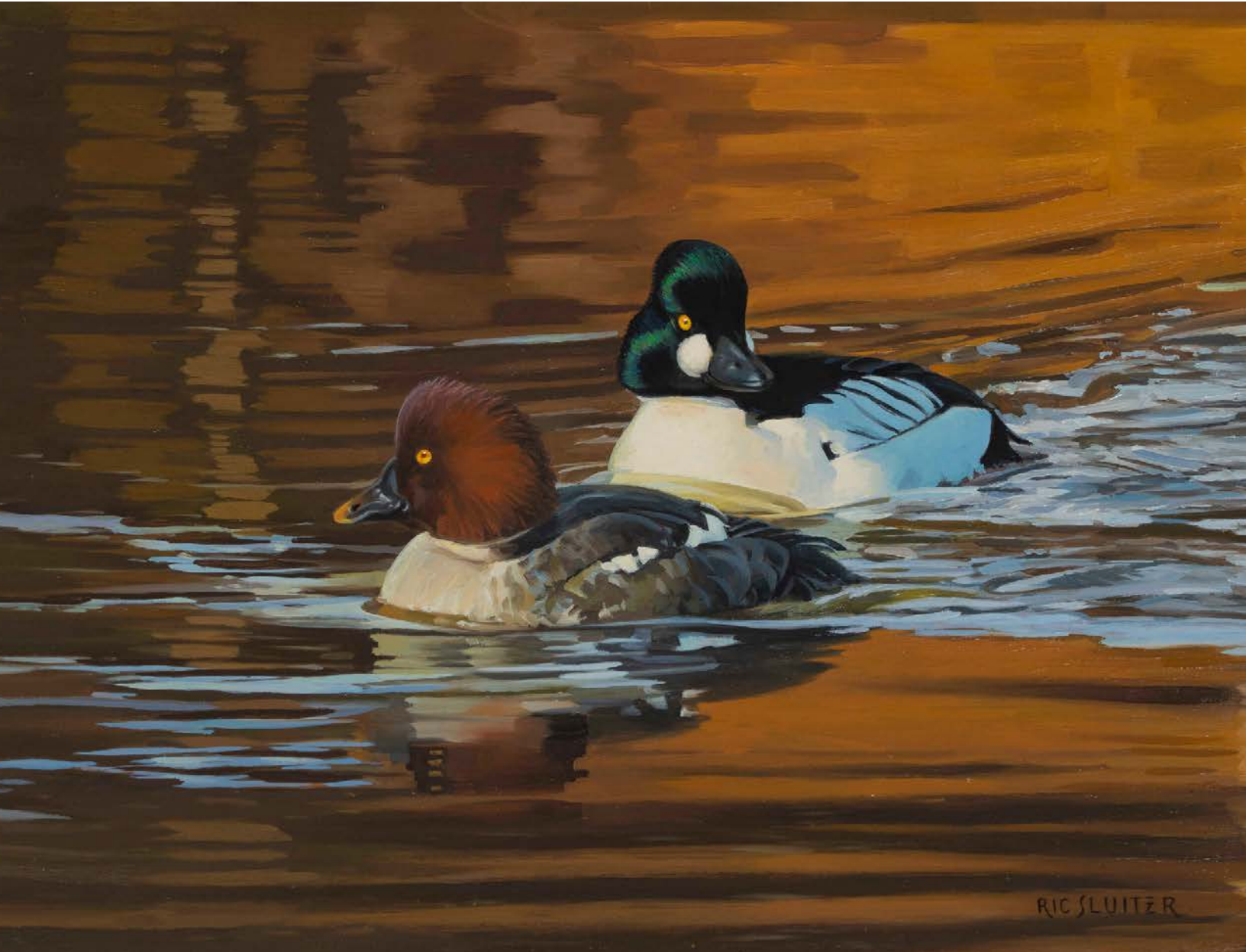
2021 Canadian Wildlife Habitat Conservation Stamp and Print image, "On Golden Pond - Common Goldeneye" by Ric Sluiter.