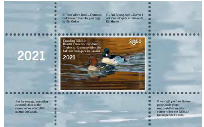
Image : Feuillet du Timbre sur la conservation des habitats fauniques du Canada 2021.

To many, hunters, conservationists and otherwise, the Canadian Conservation Stamp is much more than just a picture. While it is attached to the Migratory Game Bird Hunting Permit, it is also a symbol of conservation and a relic of memorable hunting seasons passed. We at WHC love to hear what the #WHCStampMeans to our supporters. Whether it's a stamp collection, an old permit or a conservation edition print, let us know what the stamp means to you using #WHCStampMeans on social media.