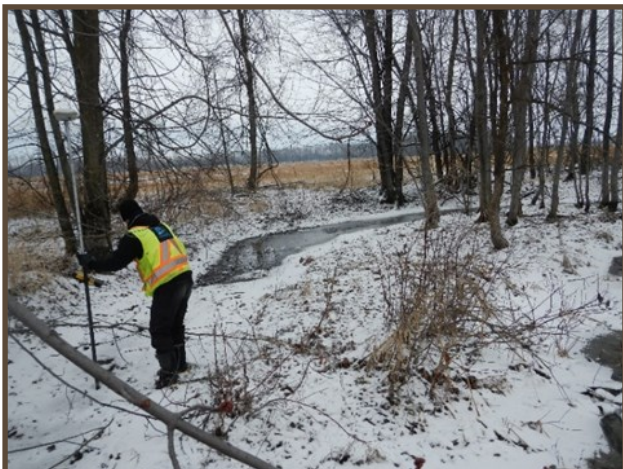
Field surveying.