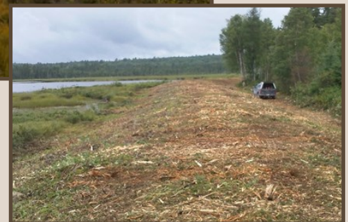
Right bank dyke (after).